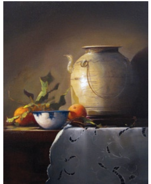
Classic Tea , oil, 20 x 16"