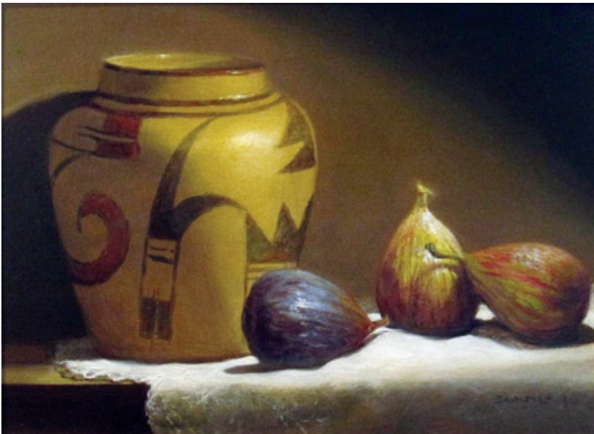
Composition with Hopi Jar , oil, 9 x 12"