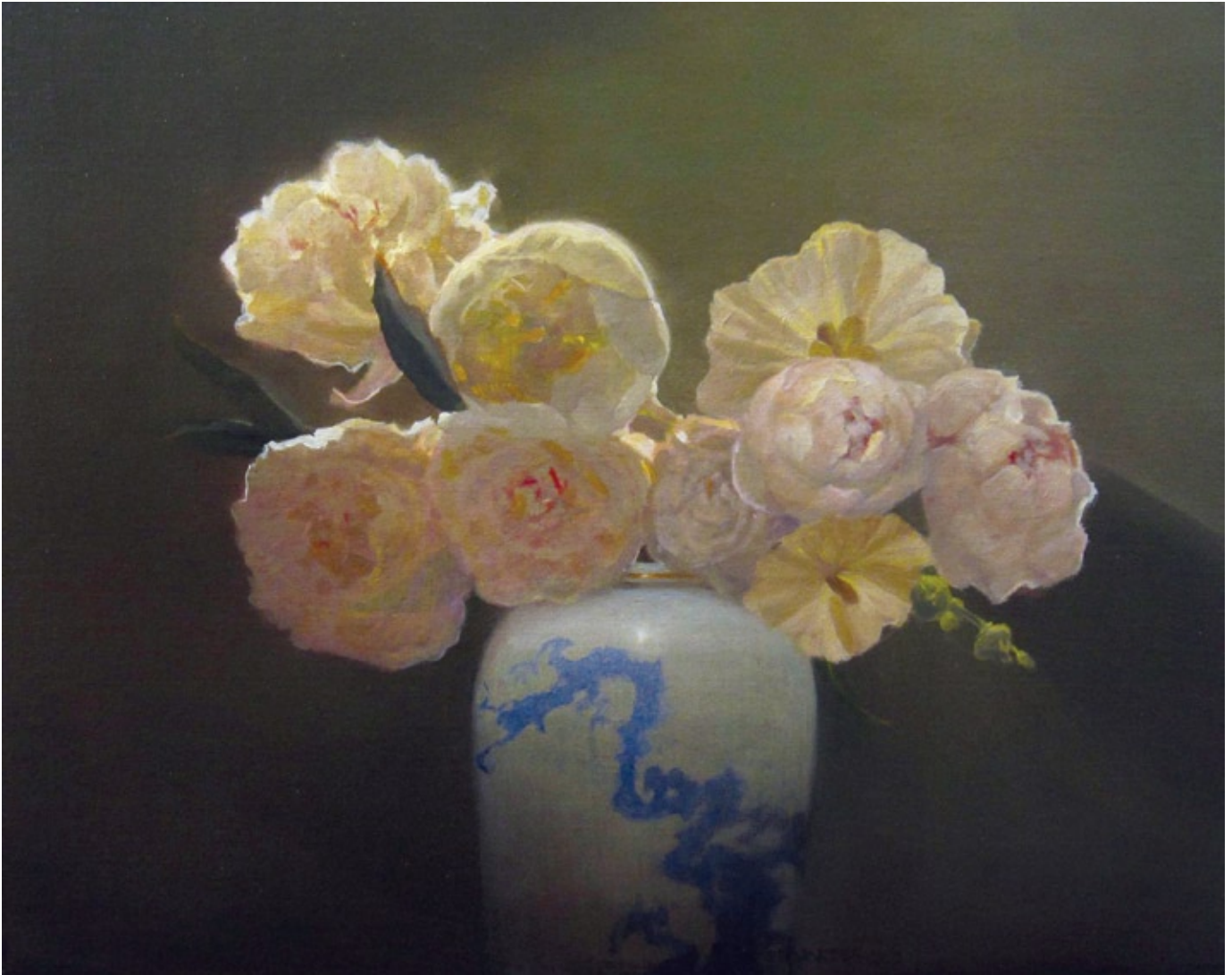
Late Garden Peonies and Hollyhocks , oil, 16 x 20"