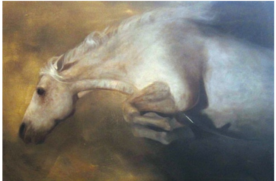
Passage , oil and gold dust, 24 x 36"

"I still find myself amazed at the instinctive