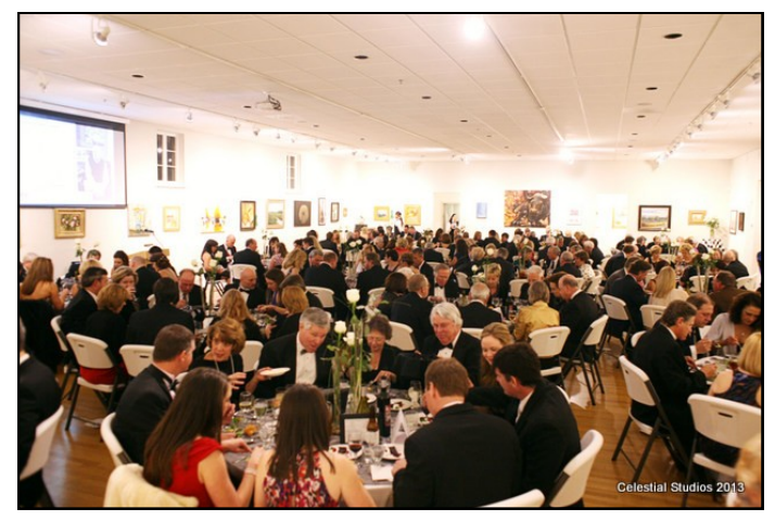
A sold out crowd enjoys fine dining and live auction.